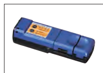
Hot jacket remover JR-6+