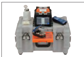
Carrying case with worktable CC-72