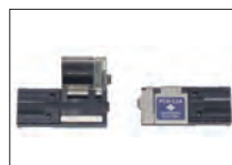
Pitch changing holder PCH-12A