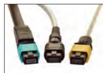
Available for Lynx-Custom Fit™ Splice-On Connector